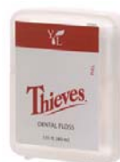
Item No 4463