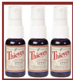
Item No 3266