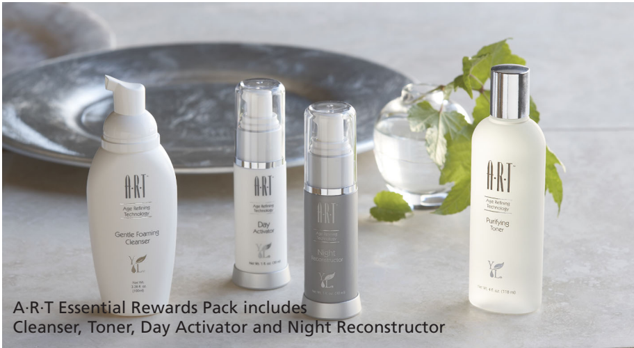
A-R-T Essential Rewards Pack includes Cleanser, Toner, Day Activator and Night Reconstructor

Vitamin C is combined with Matrixyl, to produce a 50% greater increase in skin matrix regeneration than the Peptide Complex alone. 2